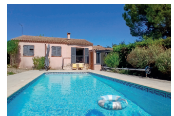
€237,600, Autignac: Single-storey villa with main residence and gîte, with a total of four bedrooms, set on a plot of 599m 2 with a pool, in a quiet spot