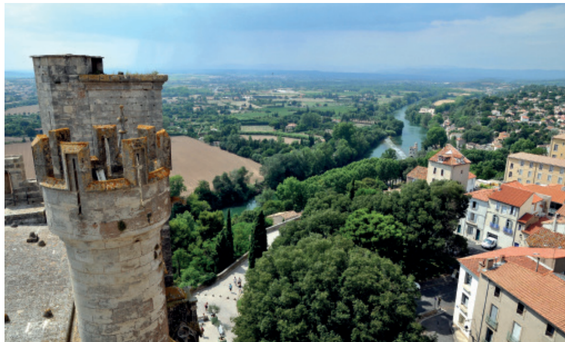
Béziers is a pleasant city with good travel links including an airport - pick a village on its outskirts for the best of all worlds

A renovation project? With no garden, €80,000; with a garden, €150,000-€250,000 - again depending on the size of the property and plot