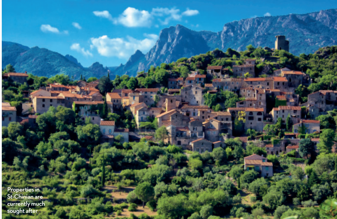
Properties in St-Chinian are currently much sought after

Both really: there's sunshine all year round (in winter it's