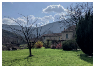
€599,000, Olargues: Edged by a river, this 17th-century watermill property comprises a characterful main building, three guest rooms, private parking and parkland