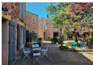
€997,500, St-Chinian: Set on a 5,560m 2 plot overlooking an old mill, this renovated stone property has a main dwelling, a gîte, a pool and great views