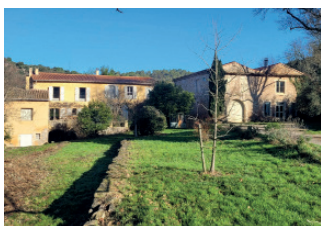
€1.275m, Béziers: This historic 11-bedroom estate, formerly a mill, is perfect for prestige events; it has nearly 1,000m 2 of living space, outbuildings and vineyard